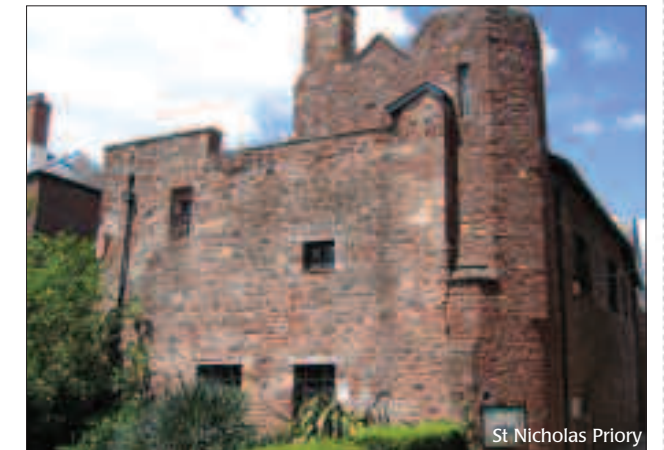
St Nicholas Priory